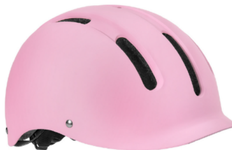
L30 PINK MATT