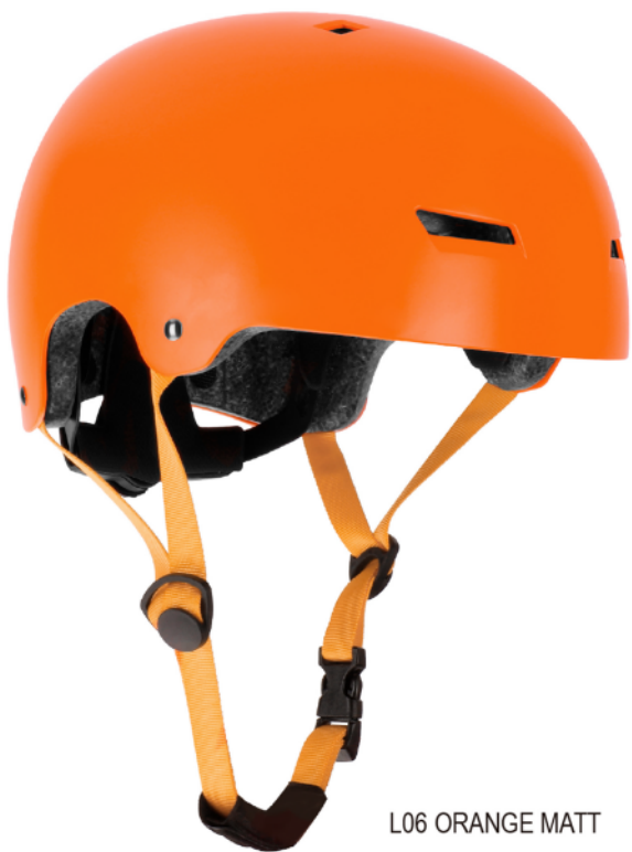
L06 ORANGE MATT