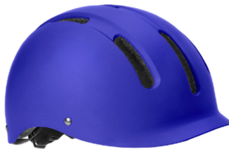
L30 BLUE MATT