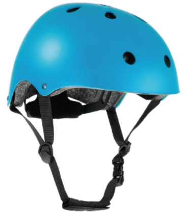
L01 METALLIC BLUE GLOSSY