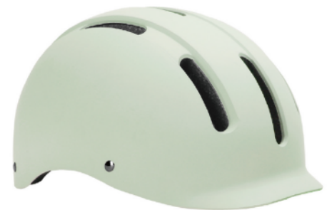
L30 OFF-WHITE MATT