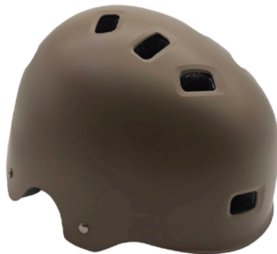
109 CHOCOLATE MATT