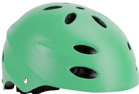
L08 GREEN MATT