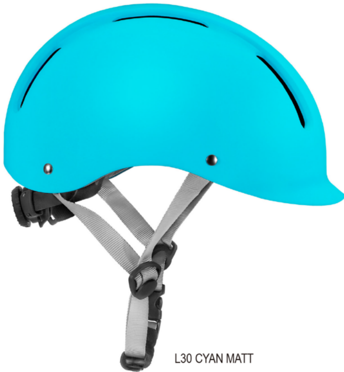
L30 CYAN MATT