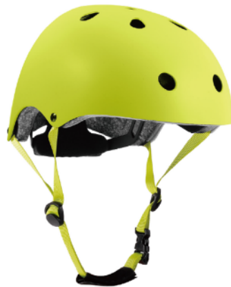
L01 LEMON YELLOW MATT