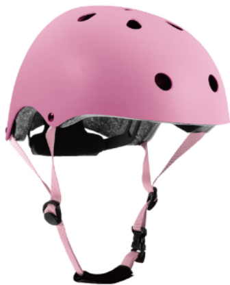
L01 PINK MATT