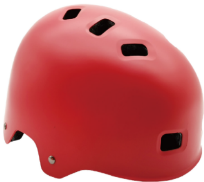
109 RED MATT