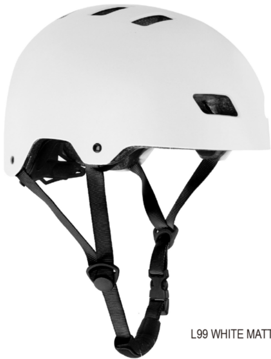
L99 WHITE MATT