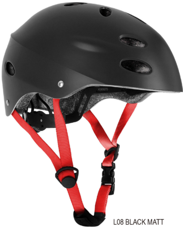
L08 BLACK MATT