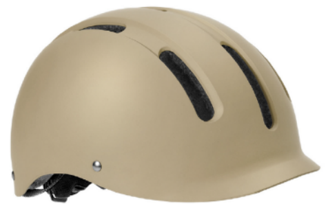
L30 BEIGE MATT