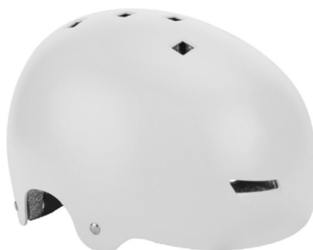
L06 WHITIE MATT