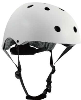
L01 WHITE MATT