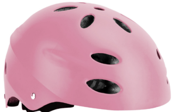
L08 PINK MATT