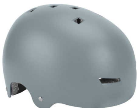
L06 GRAY MATT