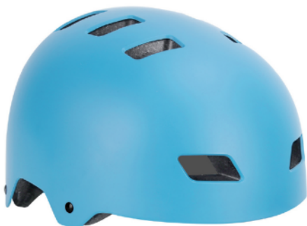
L99 BLUE MATT