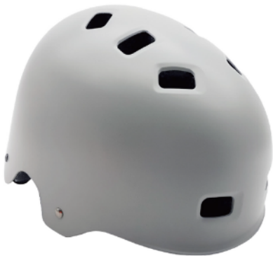
109 GRAY MATT