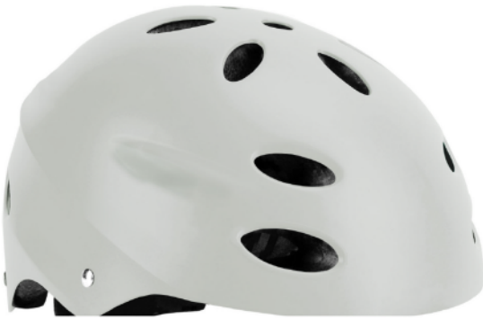
L08 WHITE MATT