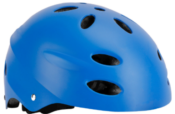
L08 BLUE MATT