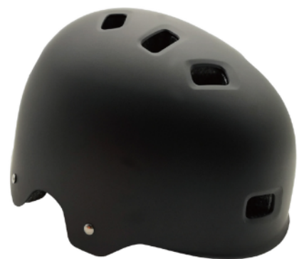
109 BLACK MATT