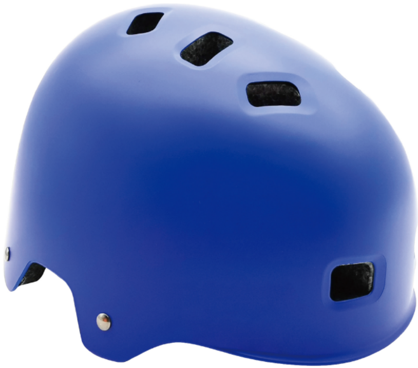
109 BLUE MATT