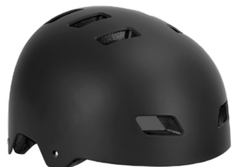
L99 BLACK MATT