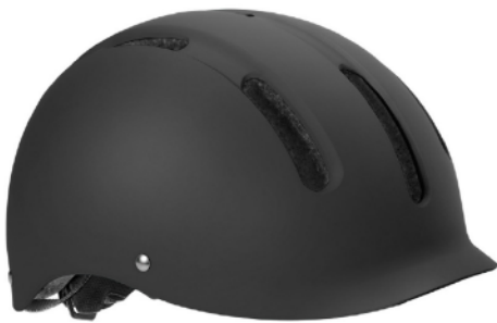
L30 BLACK MATT