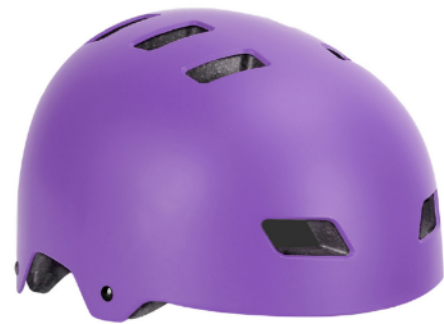
L99 PURPLE MATT