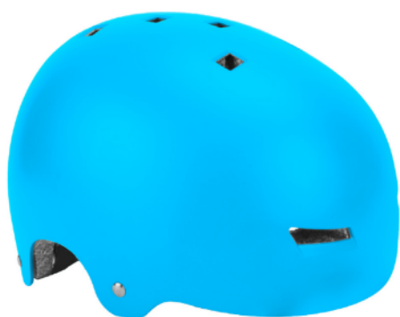
L06 CYAN MATT