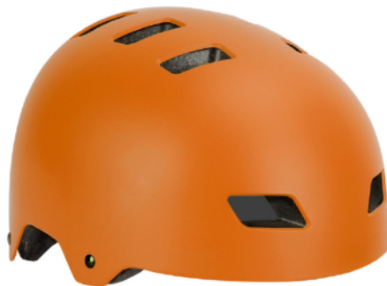
L99 ORANGE MATT