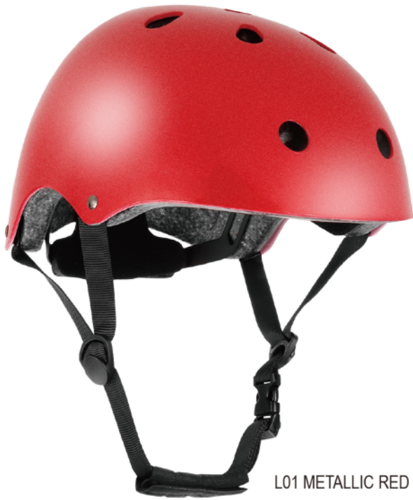
L01 METALLIC RED GLOSSY