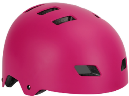
L99 CHERRY MATT