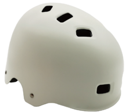
109 GRAYISH WHITE MATT