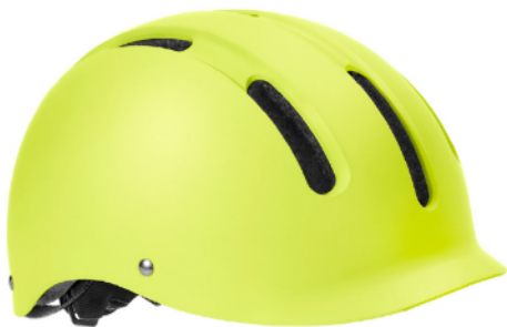
L30 LEMON YELLOW MATT