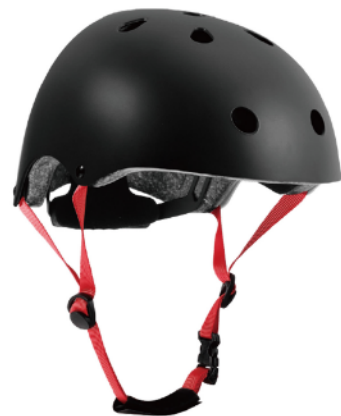
L01 BLACK MATT